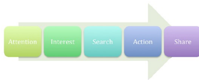
Figure 1. The AISAS model by Dentsu which is formed from Attention, Interest, Search, Action and Share.

in consumer intention to buy using AISAS model, AISAS is a model of online consumer behavior developed by Dentsu Group which is an advertising company largest in the world established in Japan. This AISAS model is considered feasible to explain consumer behavior more accurately than models previously. AISAS itself is formed from Attention, Interest, Search, Action and Share [16]. In essence, first, Dentsu's IMC approach is based on studies deep into the ideas that come from consumers. Second, not only focus on the reach and frequency of delivery of messages to the target audience (quantity) but also involving consumers (quality). Third, strategy communication is geared towards creating scenarios that lead consumers to voluntarily seek information about products, buy products, and then spread positive word-of-mouth to other consumers. Fourth, communication must look at the point of connection between consumers and brands [17] (see Figure 1).