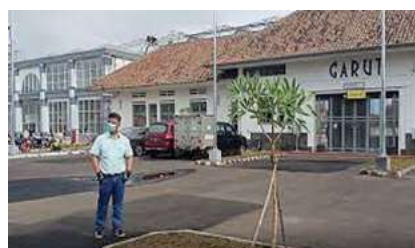
Figure 2 Spot Photo of Garut Station 2

Apart from that, currently Garut Station can also be used as an educational tourist attraction for PAUD/TK children to learn about one of the land transportation methods, namely trains. So, educational tourism in Garut Regency has increased with the existence of Garut Station. However, even though Garut Station is now a tourist attraction, it cannot be denied that the destination image of Garut Station is not completely good. Because destination image problems do not only occur in tourist areas such as natural tourism, artificial tourism, cultural tourism, etc., but also in landmarks in an area such as Garut Regency.