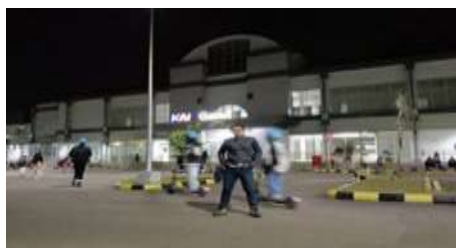
Figure 1 Spot Photo of Garut Station 1