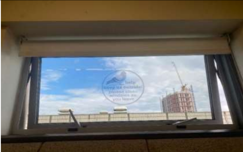
P2. Truc Huynh

“Help keep us outside! please close windows as you leave”