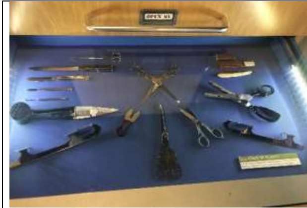
P4. Trang Dao