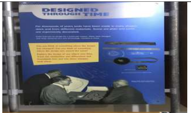
P6. Trang Dao

"Can you think of something where the design has changed? Can you think of something where the design has stayed the same? Explore the design of one object over time. Track the similarities and differences and investigate how and why these changes took place."