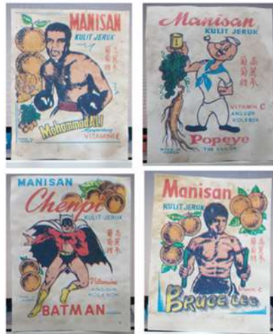
Figure 1. Candied Orange Peel Label

On the orange peel sweets label there are four different illustrations, based on the characters, they can be grouped into two, namely fictional characters and non-fiction characters. Fictional characters consist of Batman and Popeye, while non-fiction characters consist of Mohammad Ali and Bruce Lee.