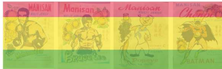
Figure 3. Division of the Layout Into Three Parts