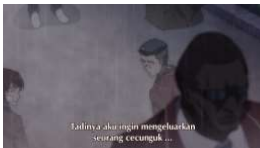
Figure 22. Resource Anime

In Figure 20 it is shown that Ryueen's plan to expel Sudou by making a complaint to class d failed to be carried out by his three men, the dialogue in Figure 20 explains that Ryueen did not directly participate in the plan he made, he only told his men to carry out his orders and wait for news or results from the work of his men, because in scene 20 his men drew a complaint without Ryueen's permission which made his plan fail, finally in Figure 21 Ryueen told Albert to hit his three men for failing to carry out his duties.