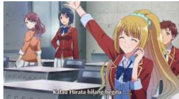
Figure 4. Resource Anime

Youkoso Jitsuryoku Sjihou Shugi no Kyoushitsu e Season 1 Episode 4. Minute 12:31