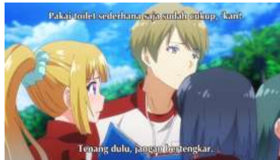
Figure 7. Resource Anime

Youkoso Jitsuryoku Sjihou Shugi no Kyoushitsu e