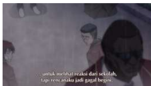
Figure 23. Resource Anime

Youkoso Jitsuryoku Sjihou Shugi no Kyoushitsu e Season 1 Episode 6. Minute 19:30