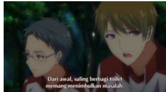
Figure 9. Resource Anime

Youkoso Jitsuryoku Sjihou Shugi no Kyoushitsu e