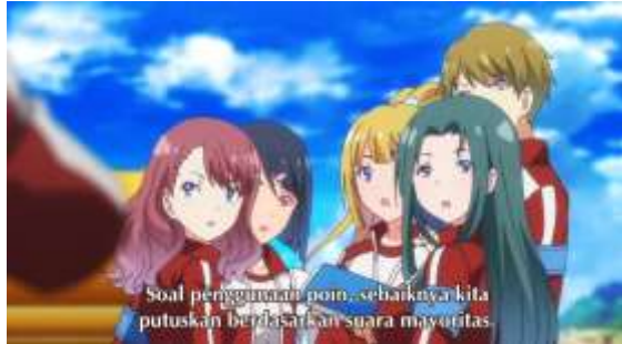
Figure 5. Resource Anime

Youkoso Jitsuryoku Sjihou Shugi no Kyoushitsu e