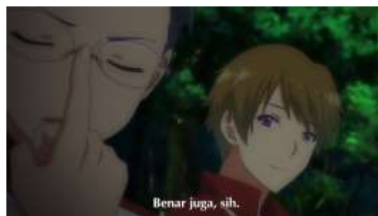
Figure 12. Resource Anime