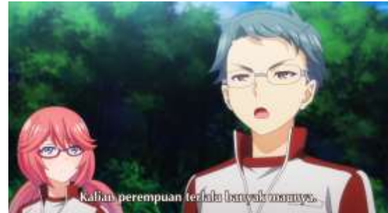
Figure 6. Resource Anime

Youkoso Jitsuryoku Sjihou Shugi no Kyoushitsu e