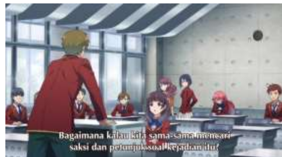
Figure 2. Resource Anime

Youkoso Jitsuryoku Sjihou Shugi no Kyoushitsu e Season 1 Episode 4. Minute 12:25