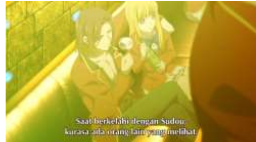
Figure 17. Resource Anime

Youkoso Jitsuryoku Sjihou Shugi no Kyoushitsu e Season 1 Episode 4. Minute 10:20