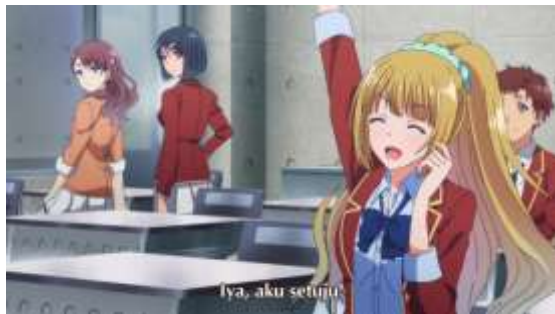
Figure 3. Resource Anime

the class leader in picture 1 wants to believe his friend and does not believe that his friend Sudou did this if it has not been proven, it is evident in picture 2 that he is trying to convince his friends to help him find evidence and facts about the incident. This nature shows the attitude of a leader who cares about his friend and will not easily believe in rumors before there is real evidence.