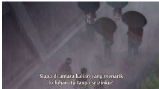
Figure 20. Resource Anime

Figure 18 shows the scene when Ryueen's men are about to be beaten by Albert until they are battered and in Figure 19 shows Ryueen's men who have been battered which makes him look like a victim of Sudou. Figure 19 can also be an indication of the cruelty of Ryueen who had the heart to make his own friend battered like that just for his goal of getting Sudou out of that school. It is this leadership attitude that makes Ryueen a boss who is feared by his class and not a leader who is trusted by his friends.