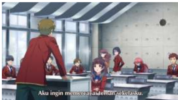
Figure 1. Resource Anime

Youkoso Jitsuryoku Sjihou Shugi no Kyoushitsu e Season 1 Episode 4. Minute 12:25