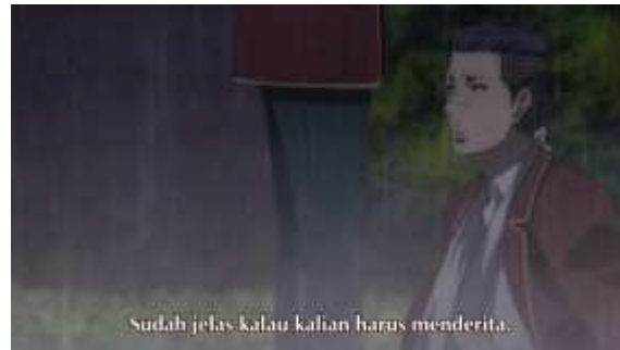
Figure 24. Resource Anime

Figures 22 and 23 explain why Ryuen wanted to expel Shidou, who he thought was a scumbag, just to see the reaction of the school, but the plan failed because of his three men who withdrew their complaints.