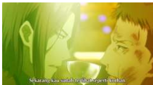
Figure 19. Resource Anime

Youkoso Jitsuryoku Sjihou Shugi no Kyoushitsu e Season 1 Episode 4. Minute 10:28