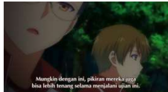
Figure 11. Resource Anime

Youkoso Jitsuryoku Sjihou Shugi no Kyoushitsu e