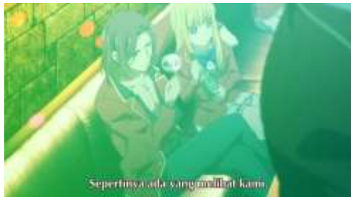
Figure 16. Resource Anime

From the three pictures above, it slightly shows the cruel and intimidating attitude of Ryuen Kakeru which makes Sudou tremble. Ryuen wanted to get Sudou out by all possible means. In contrast to Hirata who has a kind-hearted character, Ryuen has a cruel character and he will sacrifice his friend to achieve his own satisfaction. His character refers more to the attitude of a boss who is more concerned with himself than others.