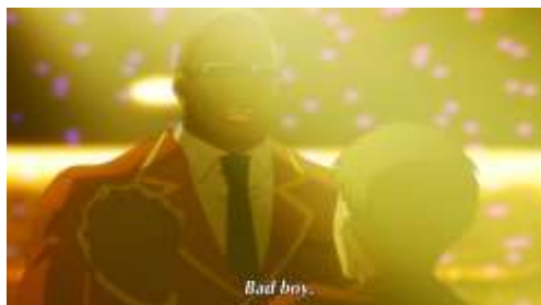
Figure 18. Resource Anime

The two scenes depicted in pictures 17 and 18 explain that Ryuen's strategy in getting Sudou out was to let his men fight with Sudou and make his men the victims of the fight so that later class c would file a complaint to class d because Shidou had fought with his men for no reason. However, because there were people who had seen the incident, without orders Abert beat Ryuen's men to a pulp.