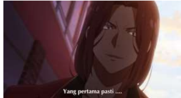
Figure 14. Resource Anime

Youkoso Jitsuryoku Sjihou Shugi no Kyoushitsu e Season 1 Episode 3. Minute 02:40