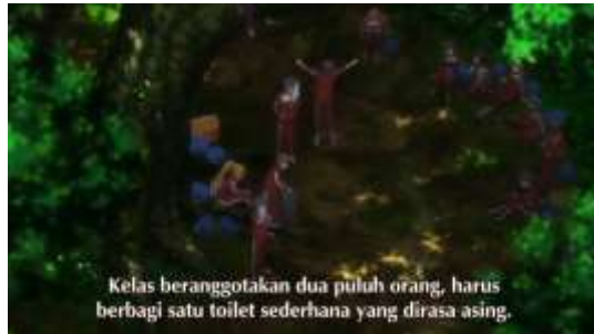
Figure 8. Resource Anime

Youkoso Jitsuryoku Sjihou Shugi no Kyoushitsu e