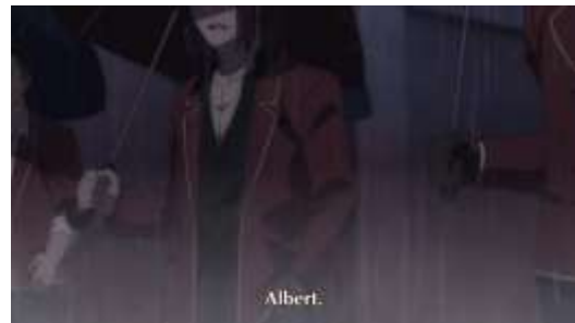
Figure 21. Resource Anime

Youkoso Jitsuryoku Sjihou Shugi no Kyoushitsu e Season 1 Episode 6. Minute 19:11