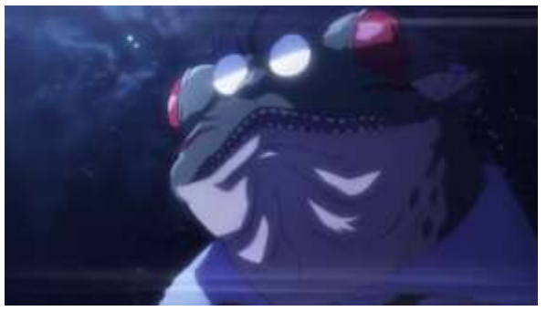
Figure 10 Scene Demiurge takes it seriously