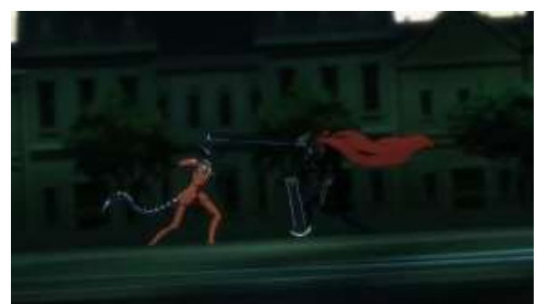
Figure 11 Scene of Ainz fought the Demiurge

This happened as in picture 9 and Demiurge took Ainz's words seriously which made Demiurge immediately design his plan to domination the world. But Ainz's goal in that world is to raise his name so that his friends who might be transferred to that place can find out about it. This is what makes the plot of the story in this anime change which initially runs with Ainz who should be the protagonist in the world making Ainz the Antagonist in the world. The beginning of the plan that made Ainz's character widespread was with an invasion attack from the Demiurge character to the kingdom of Re Eztize and Ainz, who was fond of being an adventurer named Momon, came to save the kingdom and won the battle. This incident occurred in Season 2 in episode 11 to episode 13.