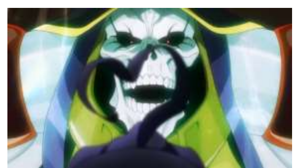
Figure 1 scene that illustrates the effect