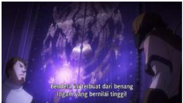
Figure 6 Scene of Nazarik being plundered