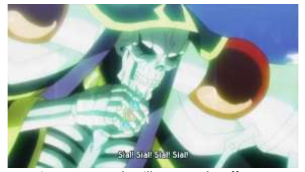
Figure 2 scene that illustrates the effect