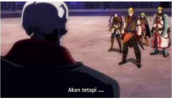
Figure 7 Scene of Ainz fought the plunderers

Figure 6 Scene of Nazarik being plundered