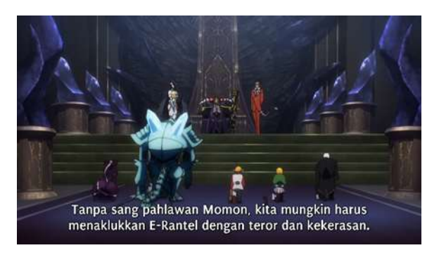
Figure 13 Scene about the Demiurge's plan

The plan was at first Ainz thought to spread his name widely so that his friends who might be transferred could also recognize him and come to him because the plan had interference with Demiurge's character. But this is different from the thoughts of the Demiurge character, where this is the first step in conquering a city under the auspices of the Re Eztize kingdom, namely the city of E Rantel by making Momon's name more widespread because his name is big in the city of E Rantel. That way the city of E Rantel can be controlled by the Nazarik guild without fear of its inhabitants and become a new kingdom. This plan he said in Season 3 episode 9 minute 20.25.