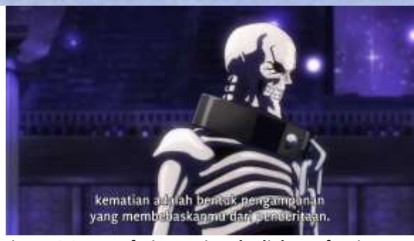
Figure 8 Scene of Ainz saying the lightest forgiveness