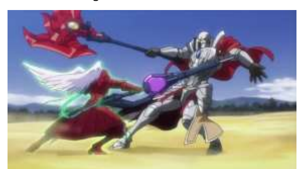
Figure 3 Scene of ainz fought shaltear