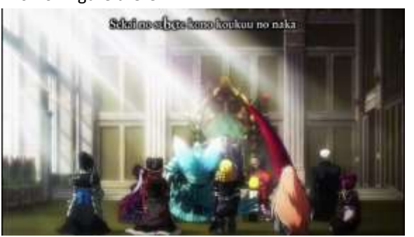
Figure 15 Scene of Ainz building a new kingdom