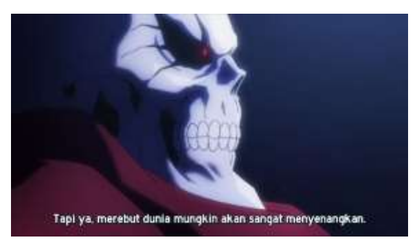
Figure 9 Scene Ainz says to dominate the world