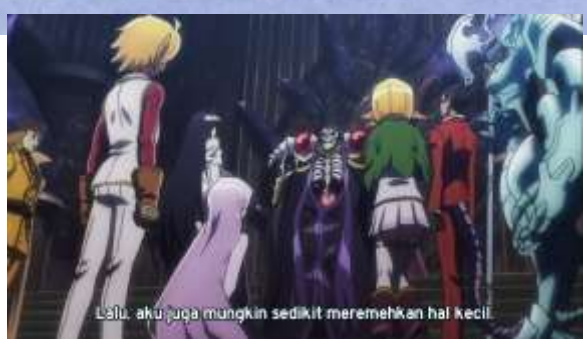
Figure 5 Scene where Ainz has another perspective