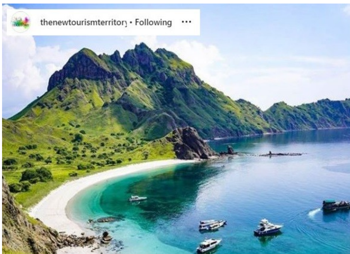
Figure 2. Labuan Bajo beach

The picture above is a tourism service Instagram account in Nusa Tenggara Timur that posts information, activities and knowledge about tourism in the Nusa Tenggara Timur that aims to introduce Nusa Tenggara Timur tourism to the wider community using Instagram users. With the existence of government-owned Instagram accounts, it is easy to provide information. with the @thenewtourismterritory account the government can share the charm of tourist attractions in Nusa Tenggara Timur one of the beaches in Labuan Bajo (see Figure 2).