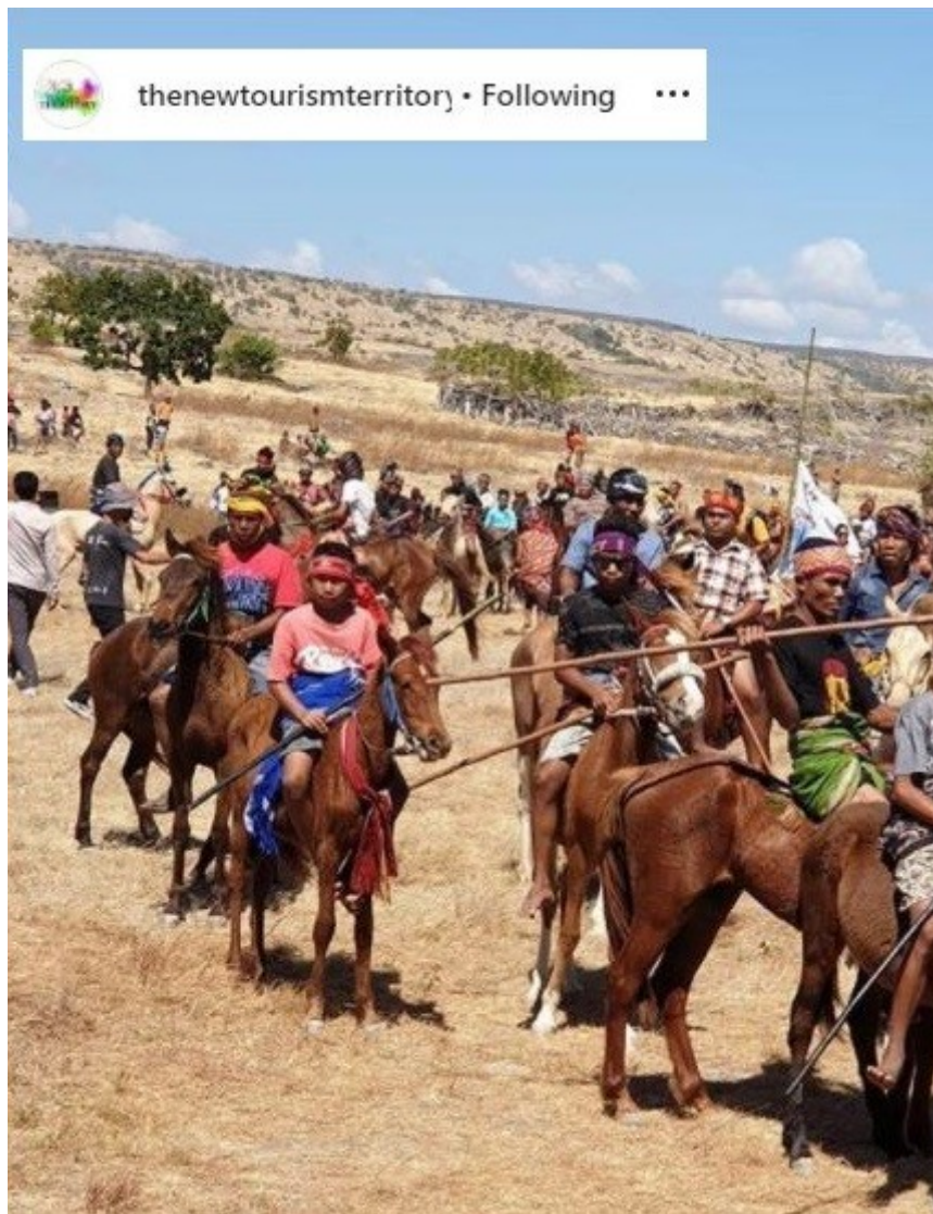
Figure 3. Horse racing in Sumba

The photos shared are one of the unique cultures found in Nusa Tenggara Timur. Horse racing is one of the traditions of the Sumba people, Nusa Tenggara Timur, and is still done to preserve local culture. So besides posting natural beauty in Nusa Tenggara Timur, it also posts a unique culture that is marked by Nusa Tenggara Timur as a support for cultural preservation. Besides that, the government-owned @thenewtourismterritory account also posts things related to tourism development in Nusa Tenggara Timur, one of which is by inviting people to always support representatives of Nusa Tenggara Timur in tourism contest events (see Figure 4).