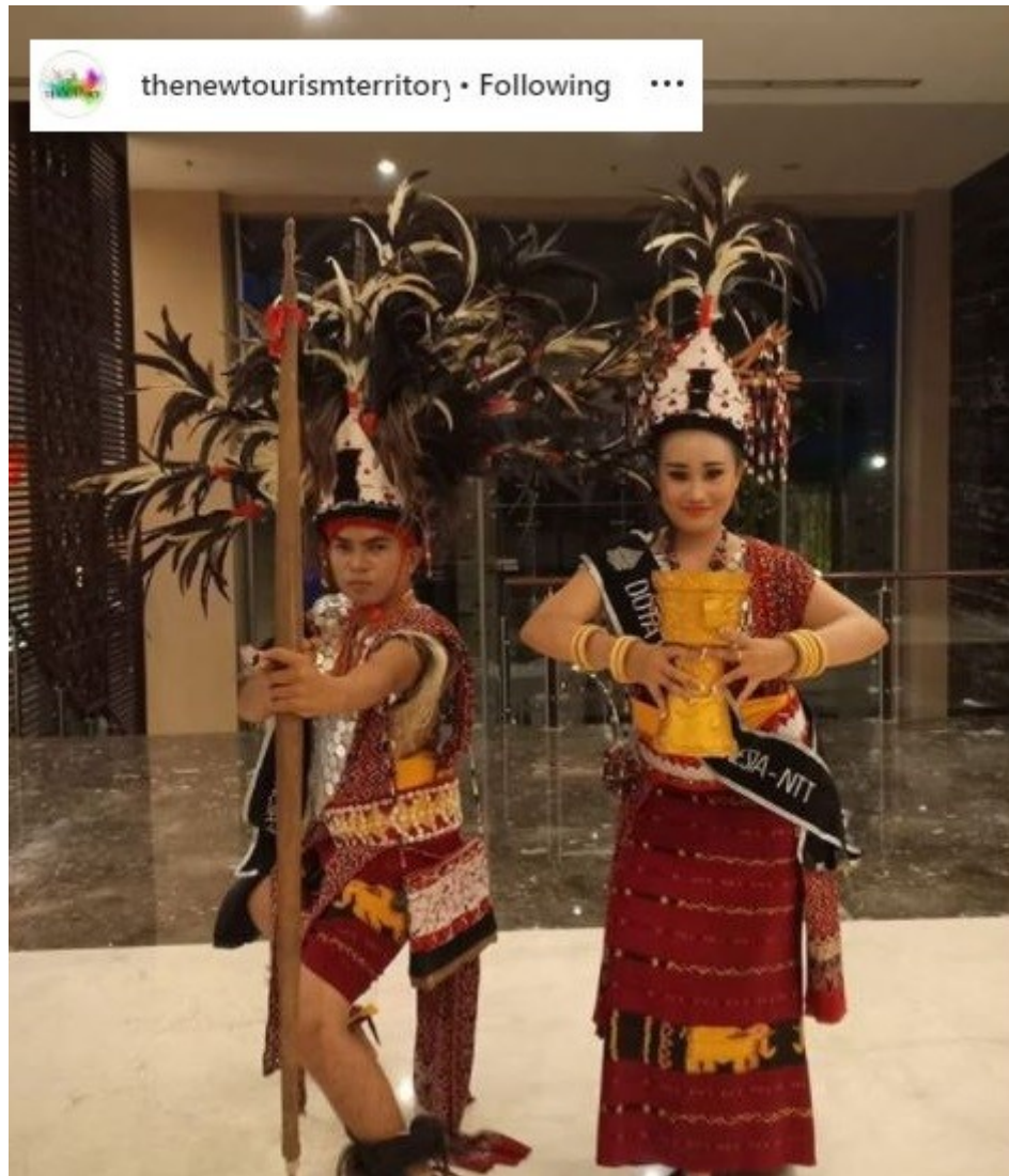
Figure 4. Nusa Tenggara Timur tourism ambassador

Another form of support for tourism in Nusa Tenggara Timur is by inviting the community to provide support for representatives of Nusa Tenggara Timur in the event of the selection of Indonesian Tourism ambassadors so that tourism in Nusa Tenggara Timur can be recognized by the wider community. with the participation of Nusa Tenggara Timur representatives in the tourism ambassador contest is one strategy to introduce tourism in Nusa Tenggara Timur and also compete in offering tourism potential. one strategy to attract visitors is by holding cultural events organized by the government of Nusa Tenggara Timur. The event was held in several cities (see Figure 5).