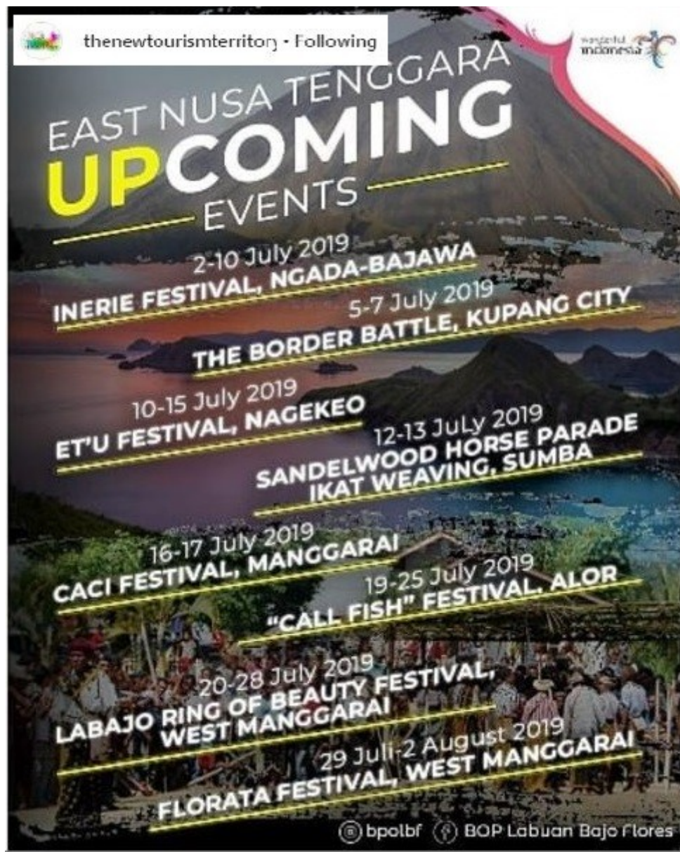
Figure 5. Poster event schedule in Nusa Tenggara Timur

The strategy of the Nusa Tenggara Timur regional government in increasing the interest of tourism visitors is by holding cultural events or related to tourism in several cities in Nusa Tenggara Timur. in the picture above shows that the government uses social media in providing information related to tourism activities. with this account, more people can easily get information.