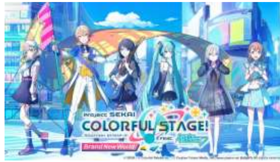
Figure 1 Project Sekai: Colorful Stage! Home

Project Sekai: Colorful Stage! or shortened to Project Sekai, is a rhythm game developed by Colorful Palette, a studio of CyberAgent's Craft Egg, which was also involved in development before switching to Colorful Palette, and published by Sega Corporation. The game is a spin-off of Sega's Hatsune Miku: Project DIVA series, and features Crypton Future Media's virtual singers Hatsune Miku, Megurine Luka, Kagamine Rin and Len, MEIKO, and KAITO, along with 20 real human characters split into five units, each with a unique theme.