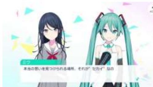
Figure 2 Project Sekai: Colorful Stage! Visual Novel gameplay

To better understand the characters, this game has 20 main story chapters as a prologue, with the stories of the five units being different and more focused on the development of their units, and there are dozens of story events that are a continuation of the main story.