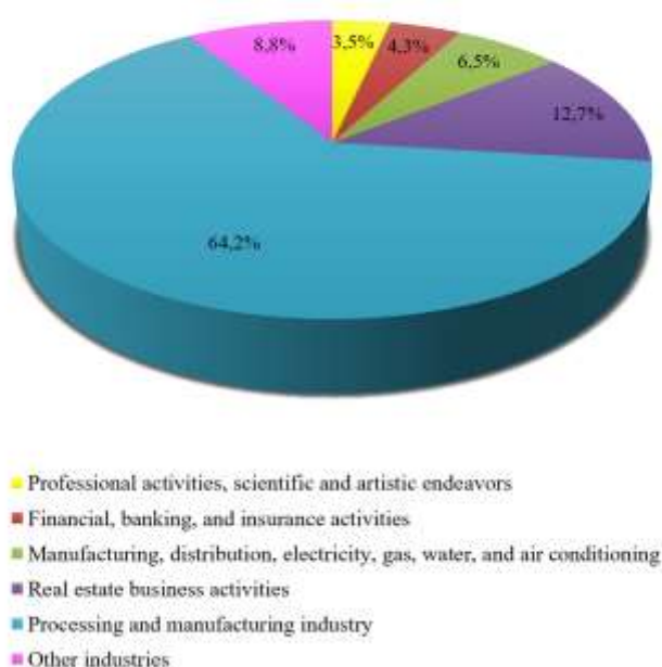
Foreign investment by economic sector in 2023