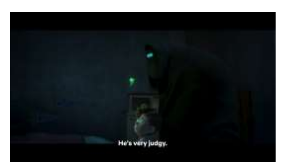
Figure 12: Scene 29:46 seconds

(Insomnia is making people unable to sleep by whispering things to people who are sleeping.)