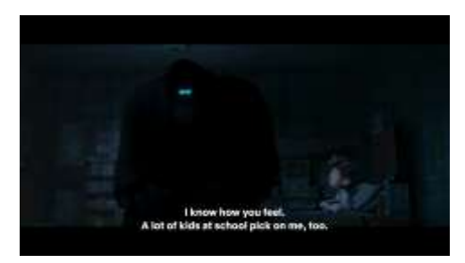
Figure 1 : Scene 15:07 seconds

Dark: Listen, I didn't ask to be a supernatural entity that evokes dread and despair. Im just a regular guy trying to do my job. But people always pick on me. Truth is, almost everyone is scared of me. Or hates me. Or thinks I'm evil. Some people think I'm nothing. Hurts a guy.