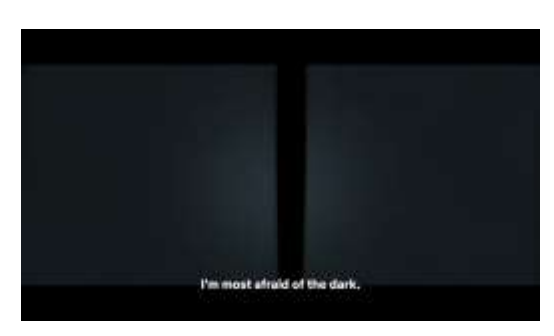
Figure 10: Scene 10:48 Seconds

Orion: This is bad! Very, very bad! It's literaly the worst! Because all of rthe things I'm afraid of, I'm most afraid of the dark.