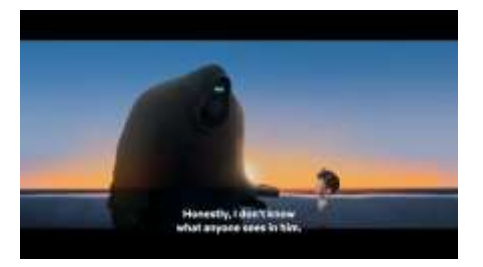
Figure 4: Scene 57:27 seconds