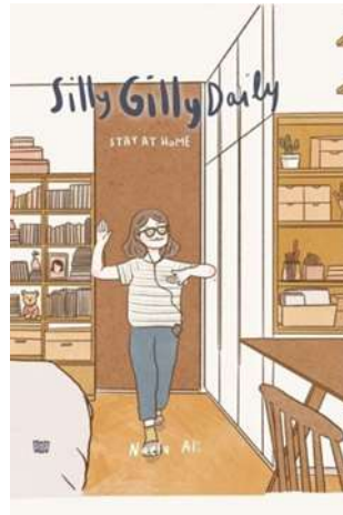
Figure 1: Illustration I Visual Approach

of reading everything about authoritarian parenting. Unconsciously, the information that wants to be conveyed is easily absorbed by the brain because there is entertainment in the form of illustrations in it.