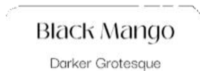
Figure 5: Black Mango Font