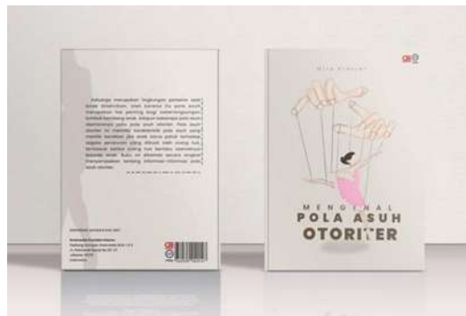
Figure 10: Book Cover

The final result of this design process is an illustration book with the title "Knowing Authoritarian Parenting" several stages starting from sketches to digital, resulting in an illustration book measuring 14 x 20 cm with a total of 32 pages. The illustration book is printed with hardcover paper material for the front and back covers, while for the contents using 80 gsm bookpaper. In addition to the cover, the number of pages in the book totals 36 pages.