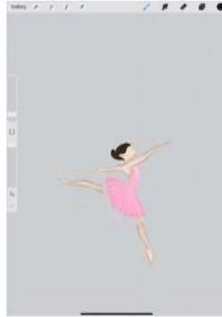
Figure 9: Ballerina Illustration

With illustrations, it can make it easier for people to understand and understand the information more quickly. In the design of information media Authoritarian Parenting, using simple illustrations in the style of watercolor illustrations. Based on everyday life. This aims to be more appropriate in the real life of the audience. The method used in making illustrations is digital, to make it easier to apply in every other information media.