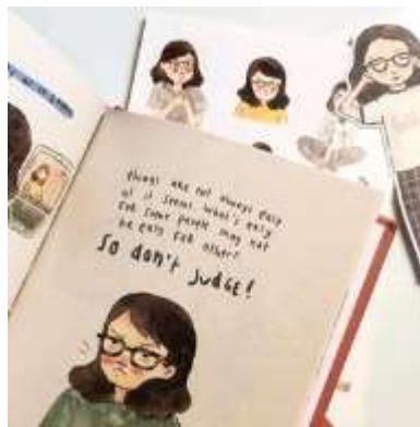
Figure 2: Illustration II Visual Approach Source: instagram.com/merakibooks (2023).