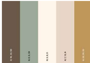
Figure 8: CMYK Color Scheme

Colors are divided into two, namely CMYK and RGB. CMYK colors are used in printing. While RGB is a color that is usually used on computer screens, lights, televisions, and cellphones. The colors that will be used in the process of making this book use a combination of retro colors that seem to have the characteristics of colors that are not too bright or striking, even tend to fade, cool and aesthetic.