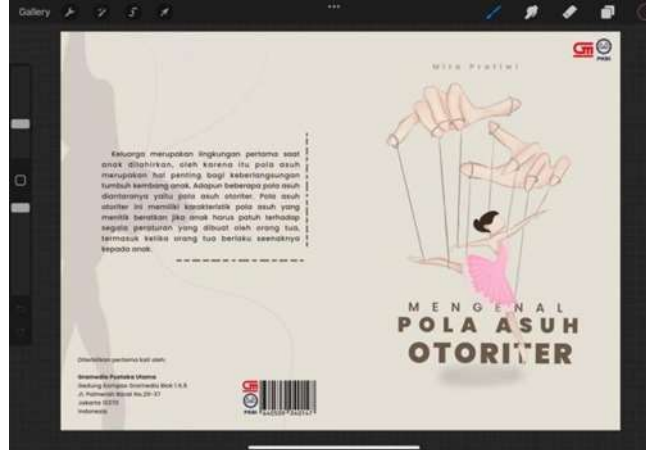
Figure 4: Book Cover

complement to the information and information conveyed neatly arranged. The Illustration Book is printed in A5 size format or uses a size of 14.8 x 21 cm.