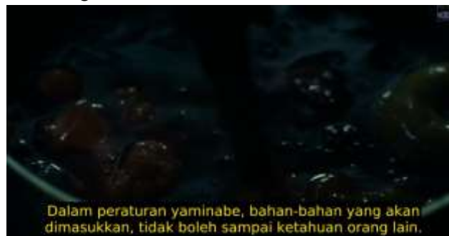
Figure 2. The contents of Yaminabe the main dish (Minutes 01.44)

This part of the scene is showing the contain of the yaminabe soup and where the all of the members asked by Sumikawa Sayuri to eat those soup while stirring the soup. Also Sumikawa Sayuri explaining the name of the soup and the ingredients.