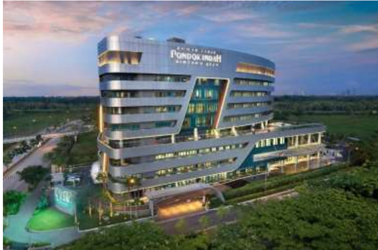
Figure 1. RSPI - Bintaro

Hospital. RSPI – Bintaro is one of other branch which has EGD with a good standard. This research will focus on RSPI – Bintaro especially in exterior signage area. This area was chosen because it relates to a sign system that can be accessed or seen by the general public crossing the area. This study will examine the design composition, color, use of materials in signage and their functions. The goal is to know the visual elements and a good sign system.