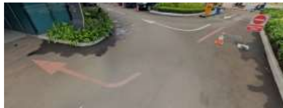
Arrow direction street sign

Arrow direction street sign , there are two color arrow directions on paved road areas. These two arrows have different purposes, the white color points to the area or path of the hospital road and the red direction points to the Emergency Room (ER).