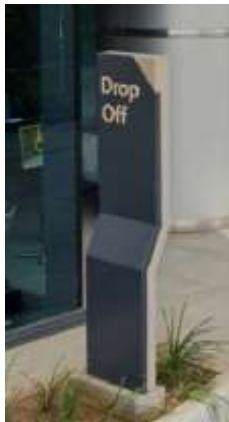
Drop Off Sign

The material used is 1.2mm galvanized plate on the body part which is duco painted according to the color. Painting is done to avoid corrosion so that it lasts a long time. In the text using acrylic