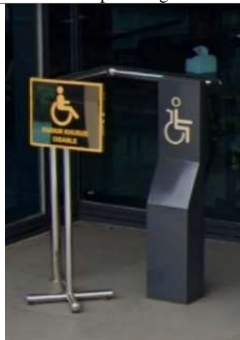
Disability parking area sign

The material used is 1.2mm galvanized plate on the body part which is duco painted according to the color. Painting is done to avoid corrosion so that it lasts a long time. In the text using acrylic