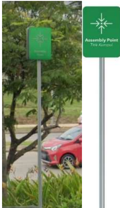
Disable parking area sign

denotes areas of special interest that must be equipped with signs and/or instructions