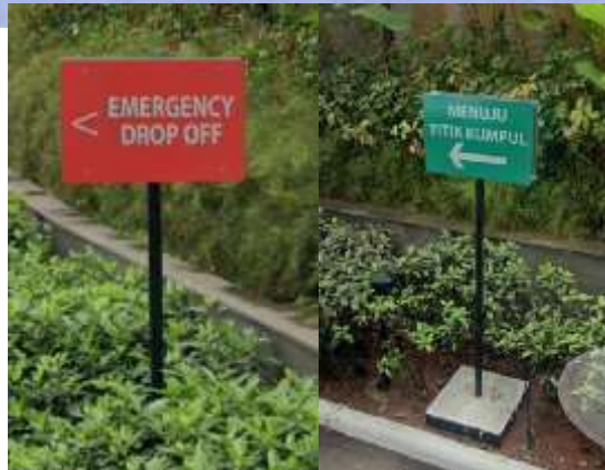
Emergency direction sign

Emergency direction sign , used as an emergency or first aid. The red color directs the emergency room (ER) for patients and the green color is used to direct the place of first aid in case of danger such as fire.