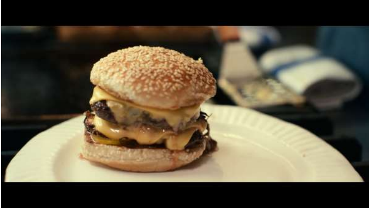
Figure 3. Cheese Burger ways to freedom (01.32.20)

Cheese burger identify the freedom on the demand of fancy and aesthetic food which is considered as important part of cuisine but sometimes meaningless. People are more focus on the appearance not on emotional evoking from tasting a good food.