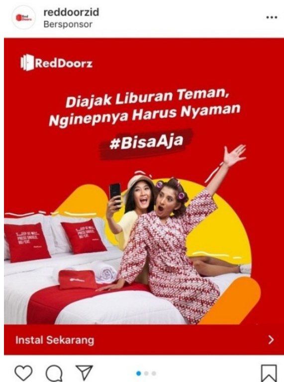
Figure 3. Reddoorz advertisement on Instagram

Figure 3, Reddorz also carries out online marketing strategies through advertisements on Instagram. This is done to get the attention of the customer who uses Instagram, which can be seen in Figure 4.