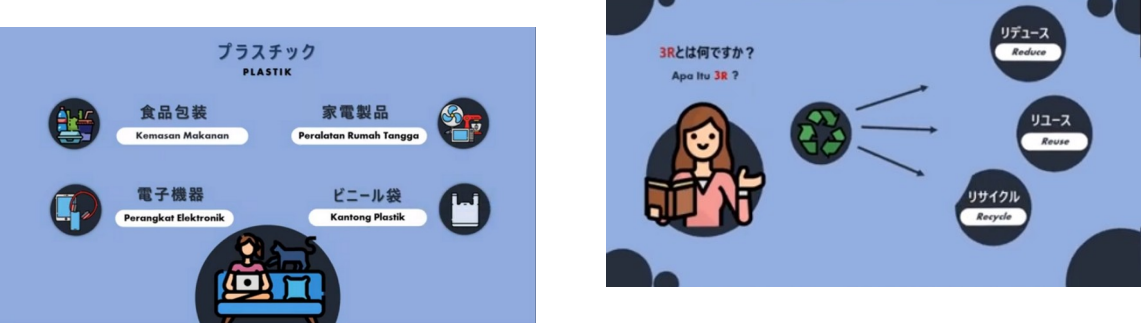
Figure 3. The Result of Infographic Video Project 2 (Plastic Waste Problems in Indonesia)