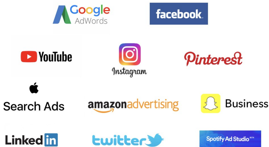
Figure 3. Examples of quite popular digital platforms