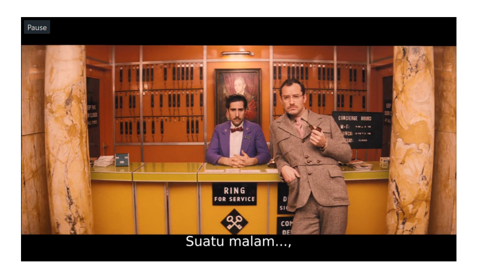
Figure 1. Author and lobyboy costume 1968

In the film The Grand Budapest which is set in 1968, the costume aspect is divided into several parts. The costume that will be discussed is the costume of a story character, a writer who tells the story of him who was on vacation at The Grand Budapest Hotel and met the owner of the hotel, Mr. Moustafa. The author's costume is clearly identified because the costume worn is the same as the costume worn in 1985 [Figure 1]. The use of the same costume as in 1985 to make it easier for the audience to identify the author's character that is conveyed in the story. The loby boy in 1985 wore the same costume as in 1932, but there are significant differences between the two. In 1985 the loby boy did not wear a hat and looked more disorganized than in 1932. This was because in 1985 the condition of the hotel was no longer at its prime, and in 1932 the condition of the hotel was at its heyday which affected the condition of the loby boy's costume style.