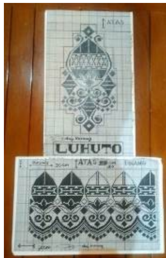
Figure 4. Luhuto / Areca Tree Karawo Design Source: Design of John Koraag (2017)

Of the 25 motifs that have a cultural philosophy, the following are visuals of some of the karawo motifs that have been given by the designer of the karawo motif (Figure 4):