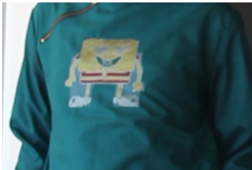
Figure 7. Karawo Spongebob Reference

As time goes by, the Karawo motive has developed, the people of Gorontalo have left the Karawo motif based on the cultural philosophy and see what phenomena are happening at this time, but the consumers themselves decide the motives they want by referring to what they like, therefore the Karawo motif until now it is growing and there will be no run out of ideas to make any motif that will be the decoration on the fabric they want. As an example of the motive below is a motif that takes the spongebob cartoon reference (Figure 7).