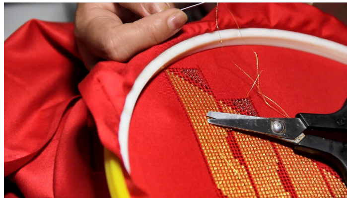
Figure 2. Proses of Making Karawo Emroidery