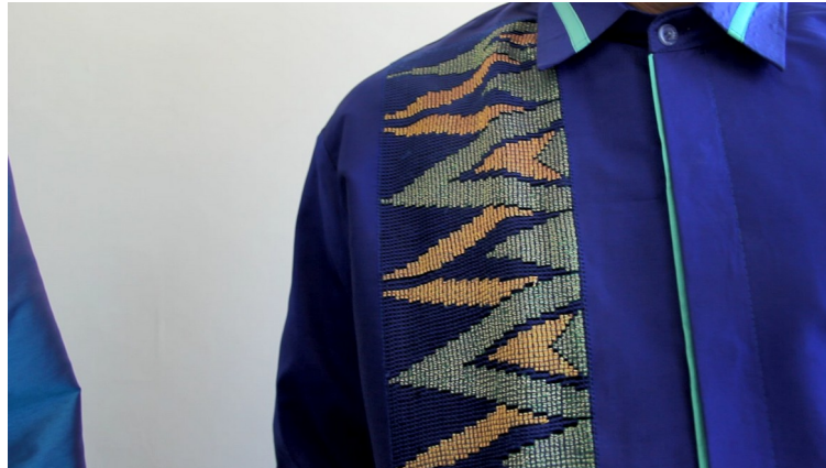
Figure 3. Karawo Ornament