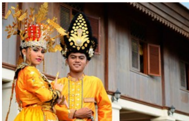
Figure 1. Bili'u Traditional Gorontalo Clothes

Of the many external cultural influences in Gorontalo, the influence of Islamic culture from the Arab community is the strongest and most influential in Gorontalo to many people of Gorontalo, therefore culture in Gorontalo is closely related to Islamic religion (Figure 1).