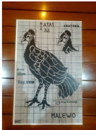
Figure 5. Malewo Bird Karawo Design

Then the making of the karawo motif, which must be based on local customary leaders, now seems to be shifting to be more modern and following something that is trending in Gorontalo. However, they still use animal motifs such as fish, because karawo decoration with animal reasons are by and large tailored from the shapes of fish. This is taken into consideration because of its relation to the geographical region of Gorontalo Province this is surrounded through the sea, in order that diverse fish shapes are not unusual place to the area people of their everyday lives [20]. The changes from the making of the karawo motif can be seen in figure 6