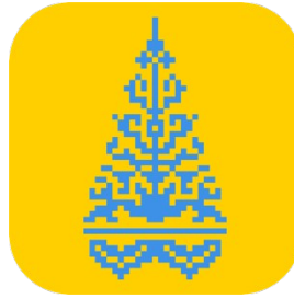
Figure 1. Visual Design of Riau Malay Motif icon

Figure 2 explain about main page design at the top of the Malay motif is displayed alternately, at the bottom two navigation buttons function to see a list of cultural motifs and values contained in the motif. Then there is a list of motifs that can be scrolled down to see the entire list of motifs in the application, then it can be selected to see the meaning of the motifs.