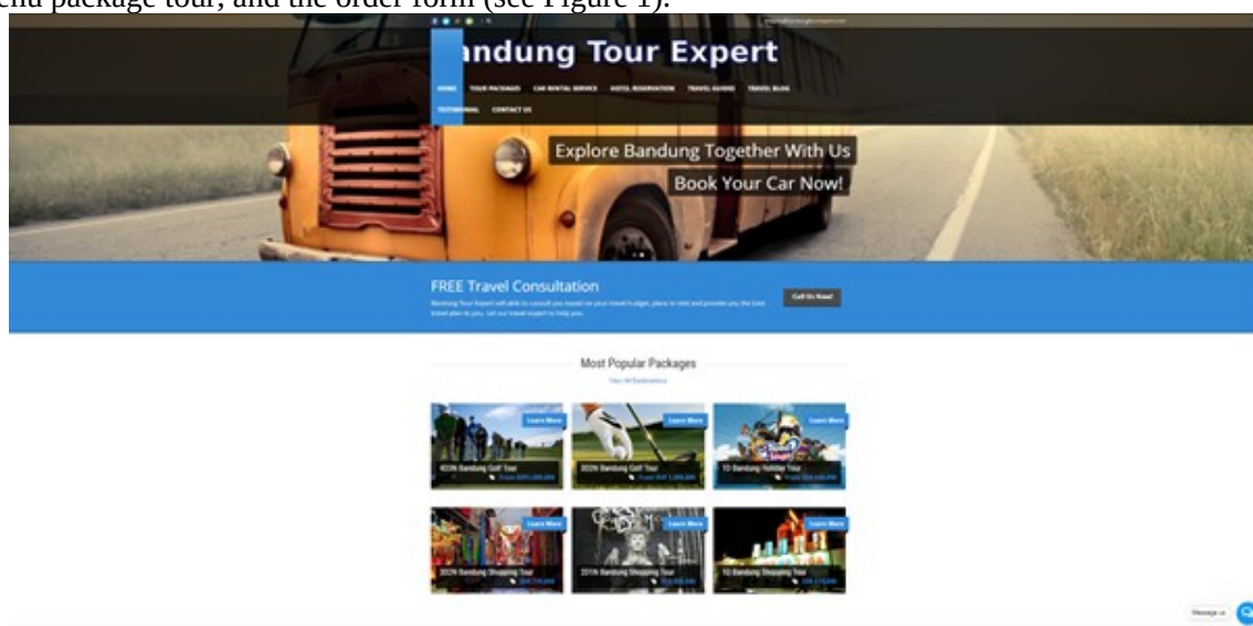
Figure 1. Main Menu

In the Main Menu view, there were various sub-menus containing products from Bandung Tour Expert. The main menu appearance was very interesting and user-friendly. The following is the sub-menu package tour, and the order form (see Figure 1).