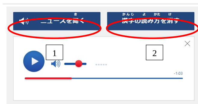
Figure 2. Listening the Audio and Remove the Kanji Readings Button

The button to listen the audio (1) and remove the kanji readings (2) is in Figure 2 as follows.