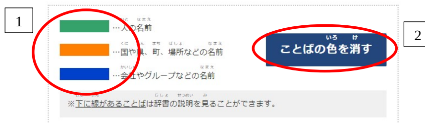
Figure 4. Color Coding

People's names in green, place names in orange, and company or group names in blue (1). We can also remove color-coding (2). The color coding is in Figure 4 as follows.