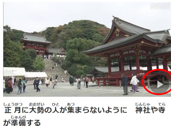
Figure 3. Video Watch Button