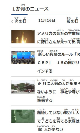
Figure 7. A Month News Article Arranged by Date

We also can read a month news article arranged by date as in Figure 7.