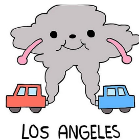
Figure 5. Los Angeles city mascot illustration

In the picture in this comic, it can be seen that the symbol of the middle finger appears to have a face with eyes, nose and a smile that form a friendly expression. It can be assumed that the middle finger symbol is considered commonplace or commonplace in the area or city of New York. However, the left hand on this symbol shows a hand symbol that seems to indicate the symbol "PEACE" which means that even though the middle finger symbol is considered impolite, there is a possibility that the community will think that it does not mean to be rude. It may be intended for certain jokes according to different contexts and speakers.