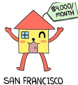
Figure 3. San Francisco mascot illustration

Then Figure 3 illustrates the city mascot that the boy imagines. In this figure he illustrates that the city mascot owned by San Francisco is a picture of a house that has a price tag of $ 4000. The illustration of the house in the comic depicts that the house has windows and doors that seem to form a smiling facial expression. Based on this figure, it can be assumed that the characteristic that characterizes the city of San Francisco is housing or property with relatively expensive monthly rental prices. This can be seen in the text $ 4000 /month ". That is why in this comic, the mascot of San Francisco is illustrated with a house with a price tag. In other words, this comic offers information that in the city of San Francisco, which characterizes the number of rental services or property or house sales services, the prices offered are relatively expensive so that Shen Comix or the illustrator considers that a picture of a house is drawn in the comic series in this third picture. fit to be the mascot of the city of San Francisco.