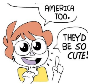
Figure 2. Second comic image

In the Figure 2, tells about the continuation of the first image. After he told him that cities in Japan have amazing mascots, then he also came back to think that cities in America should have the same mascots as in Japan.