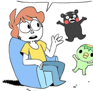
Figure 1. First comic image

The following pictures are comics that tell a story about a boy character who illustrates the mascots in America according to their place name or location. .